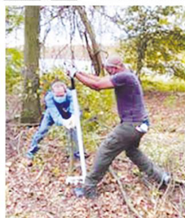
Getting brush removed.