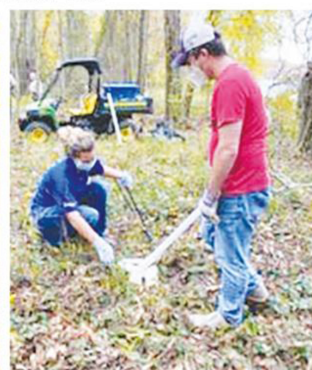
Digging holes for needed grave marking.