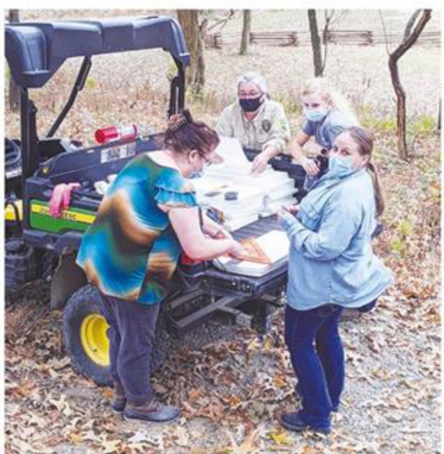
Chemours employees are undertaking work concerning grave marker numbering.