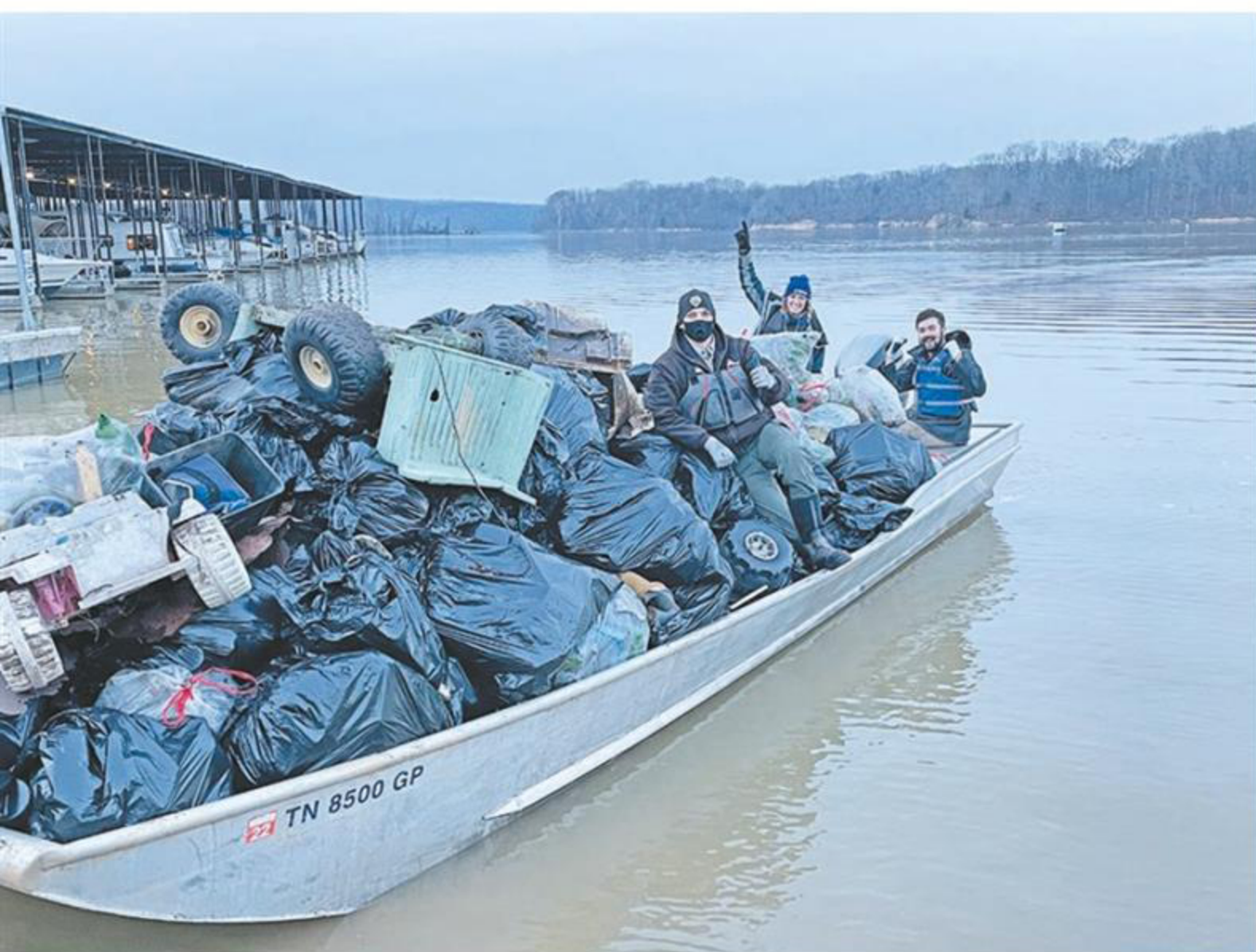
Keep the Tennessee River Beautiful's 26-foot work boat was filled with over 5,000 lbs. of trash collected by the Chemours employees in January 2022 following the Waverly, Tenn. flood in 2021.

Enclosed is my check or money order payable to The News-Democrat in the amount of _____ to start my new subscription.