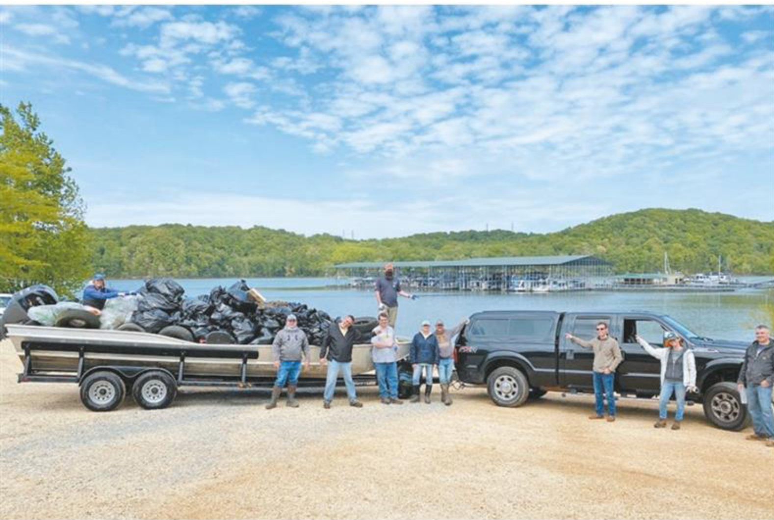
Chemours volunteers point to the truck bed cover that the company's donation helped to purchase after a cleanup they did in Earth Day 2021 to cleanup of the Tennessee River at the mouth of Trace Creek where the 2019 floods had deposited tons of litter and trash.

Keep the Tennessee River Beautiful (KTNRB) will hold its ninth volunteer cleanup in Waverly, Tenn. this Friday, April 8, from 1 p.m. – 5 p.m. in the third leg of the nonprofit's "Tennessee River Grand Slam Cleanup Series presented by AFTCO."