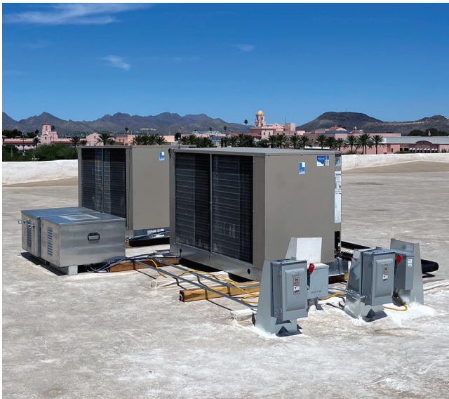
Heatcraft (Larkin) units, along with Copeland monitoring equipment