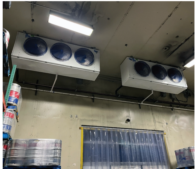
Indoor coils, installed within the keg room cooler